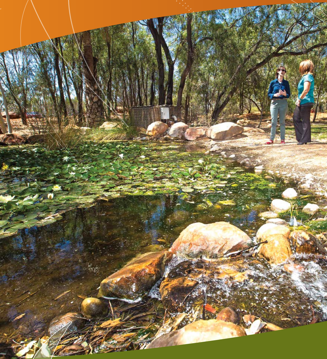
The pond at the Anetyeke Garden located at the landside front of the terminal.